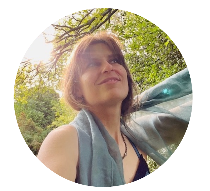
To join as an affiliate: https://naturegrooves.lumivitae.com/register

You can join LumiVitae as an affiliate. There is no charge for this. You will receive your own affiliate link, and every time someone purchases the vessel using your link, you will earn 100 EUR. I have years of experience in affiliate marketing, but I have never come across such a generous commission. Neither have I been a part of such a powerful and supportive network, including doctors, scientists, or mind-body-spirit teachers featuring on personal growth platforms such as Mindvalley.